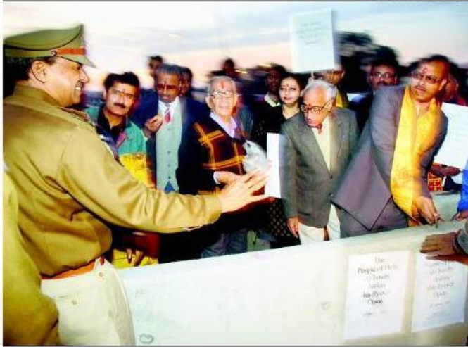
PEOPLE POWER: Residents throw open the RTR flyover in Gurgaon on Monday

"Because some politician has to come and inaugurate it, we can't be taken for a ride,"